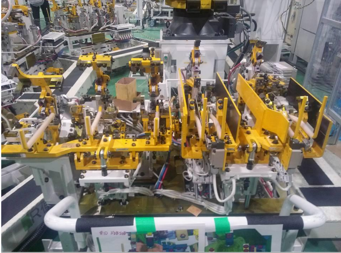
Our product for previous customer.