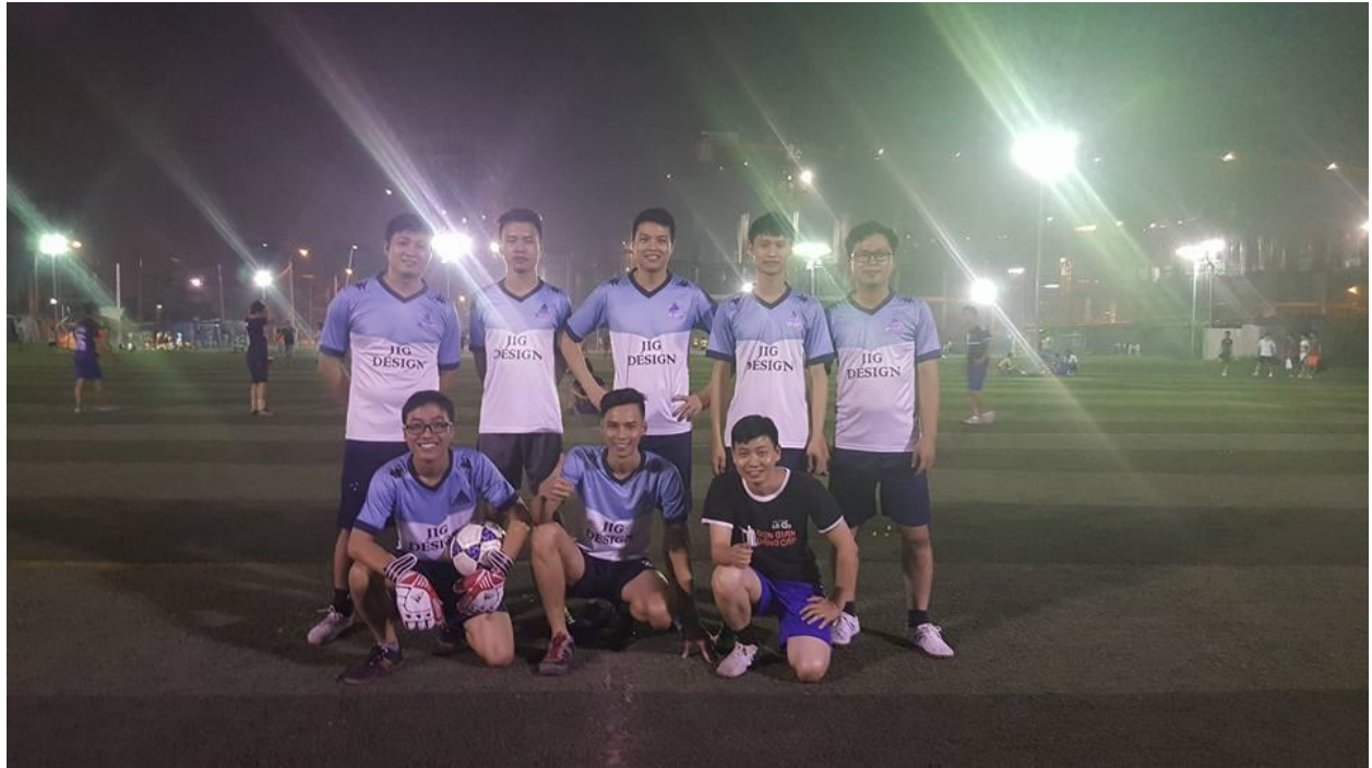
We are playing soccer after a hard working day