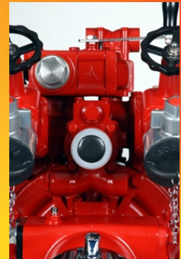
Round the pump foam induction system